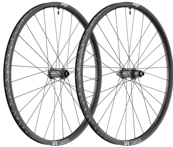
HU 1900 SPLINE®