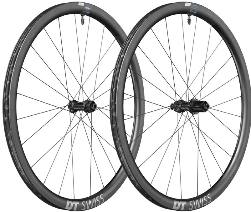
CRC 1400 SPLINE 35 MM