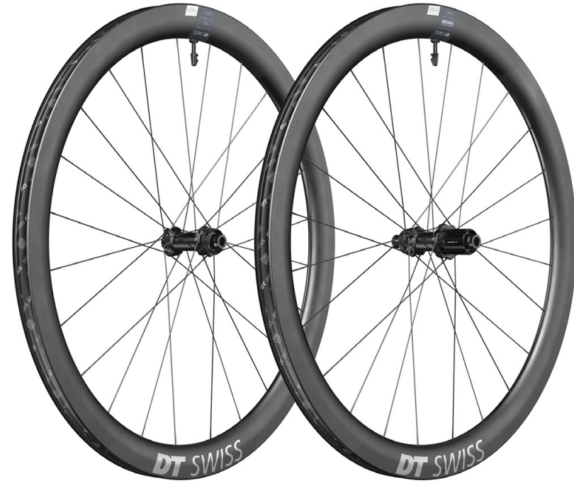
CRC 1400 SPLINE 45 MM