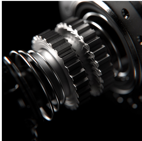
RATCHET SYSTEM TECHNOLOGY