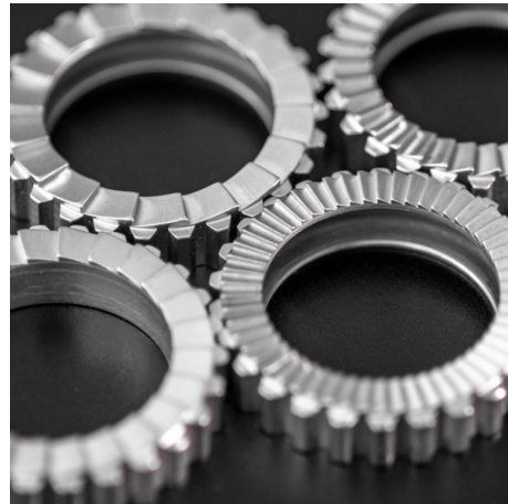
ENGAGEMENT ANGLE TECHNOLOGY