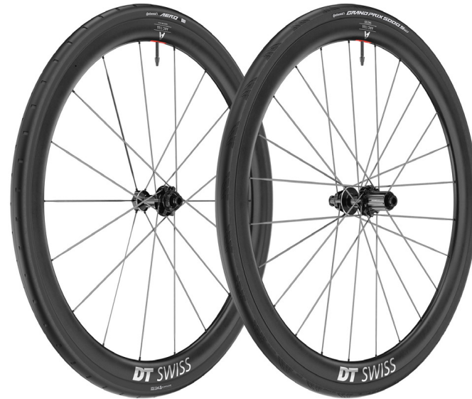
ARC 1100 SPLINE® 38 CS WTS

Available as Wheel Tire System (WTS) only