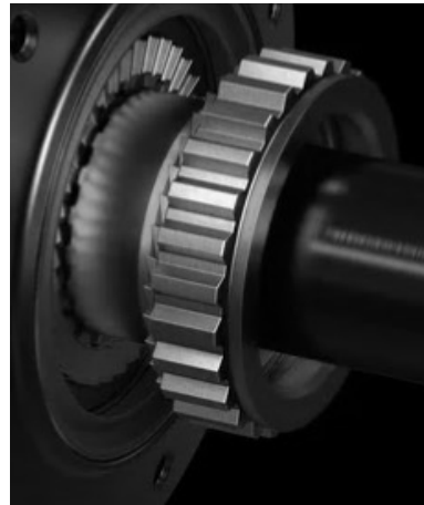
RATCHET EXP TECHNOLOGY