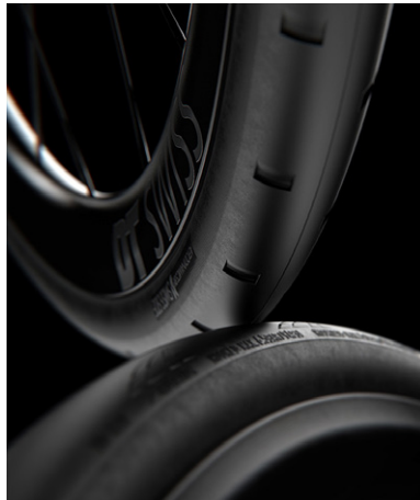
WHEEL TIRE SYSTEM TECHNOLOGY