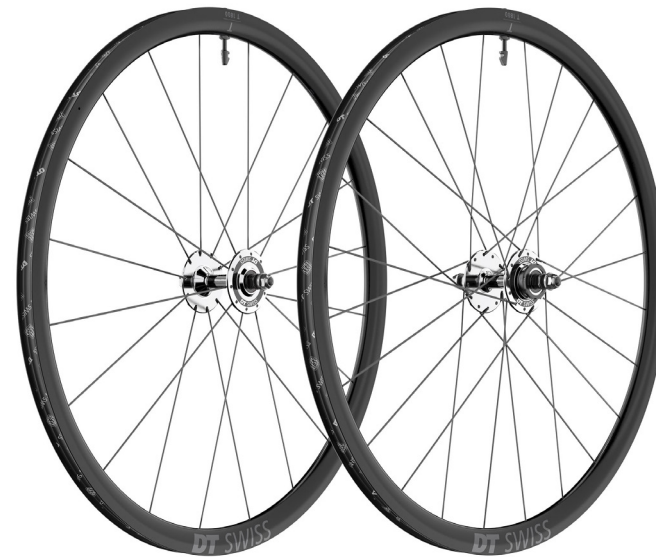
T 1800 CLASSIC® 30