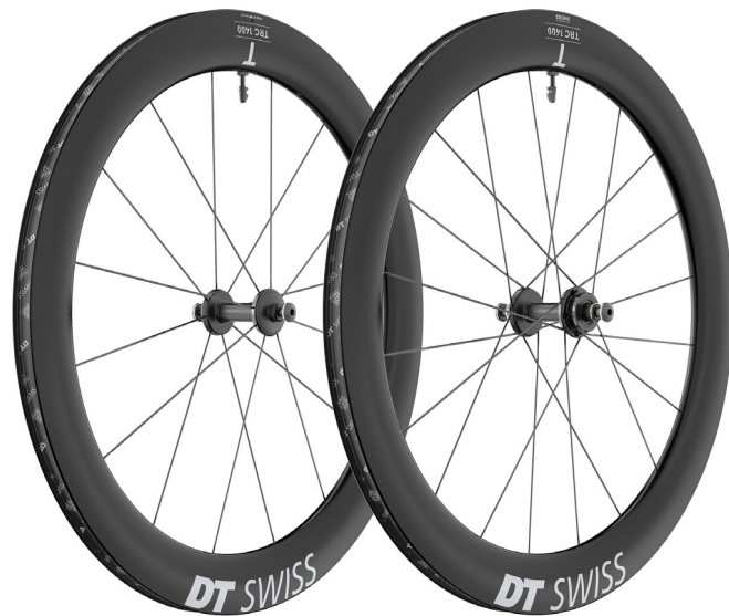
TRC 1400 DICUT® 62