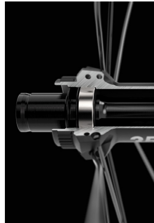
BEARING TECHNOLOGY More information →