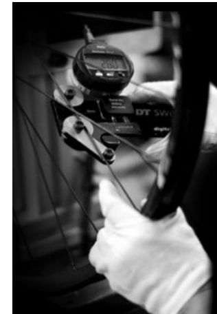
HAND-BUILT TECHNOLOGY More information →