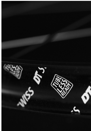
TUBELESS TECHNOLOGY More information →