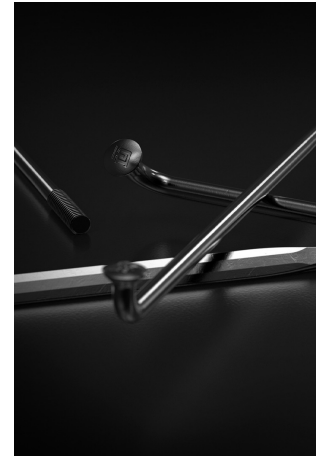
SPOKE TECHNOLOGY More information →